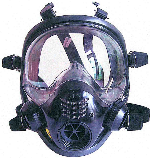
mask Shigematsu GX02