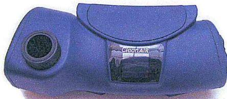
CleanAIR Chemical 2F Plus TH3