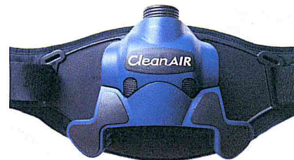
CleanAIR Chemical 3F Plus TH3

Full face mask Shigematsu GX02 in combination with a suitable filter protects the respiratory system, eyes and face the user from harmful substances in the air, depending on the type of filter used and according to the manufacturer's instructions.